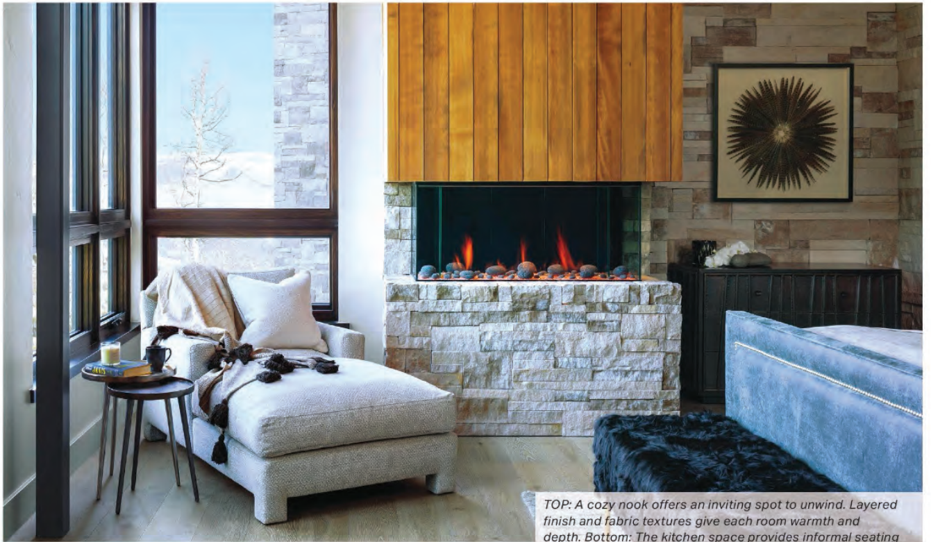
TOP: A cozy nook offers an inviting spot to unwind. Layered finish and fabric textures give each room warmth and depth. Bottom: The kitchen space provides informal seating for six. A neutral palette and pendant lighting set a relaxed environment for cocktails or a multi-course meal. >>